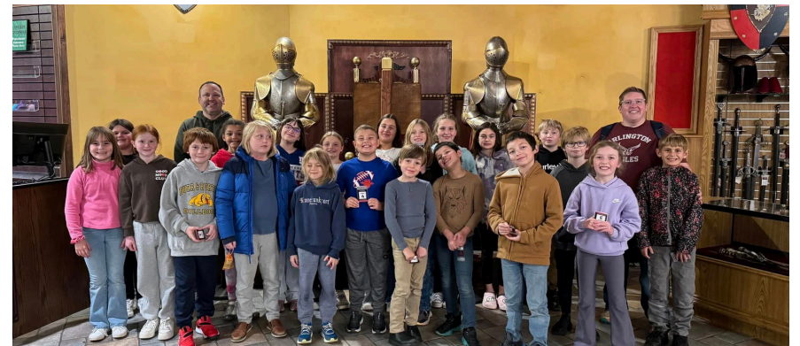
4th grade takes a trip back in time with a visit to Medieval Times!