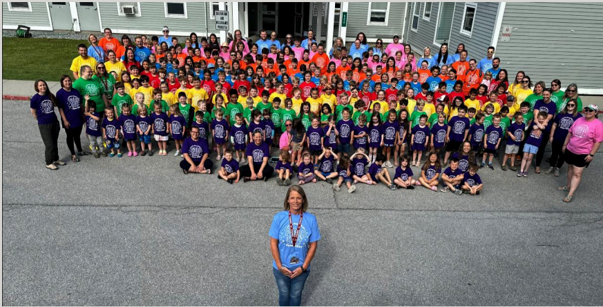
Fisher kicks off Field Day with a celebratory group photo!