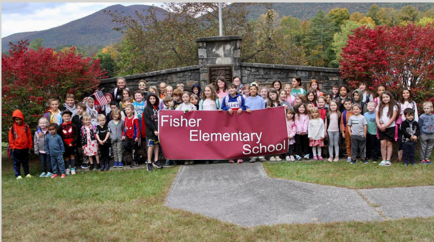
Fisher joins National Walk to School Day, promoting health and community!