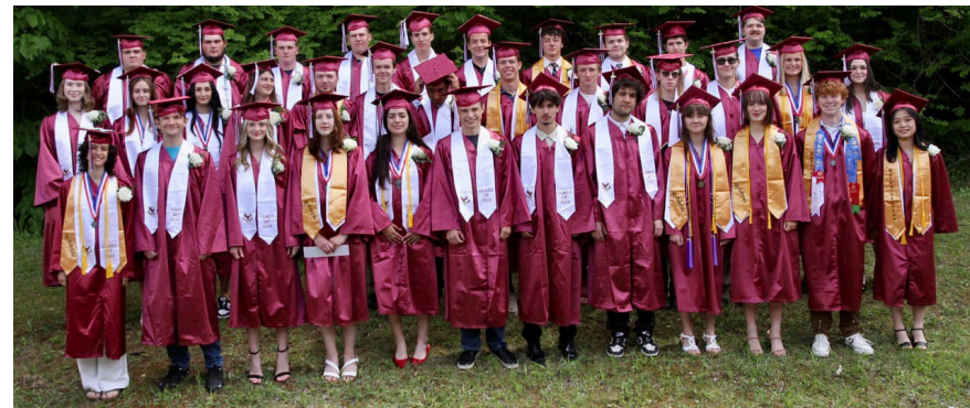
Celebrating the Arlington Memorial Class of 2024.