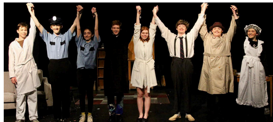
AMHS Varsity Theater proudly showcased "Gazebo."