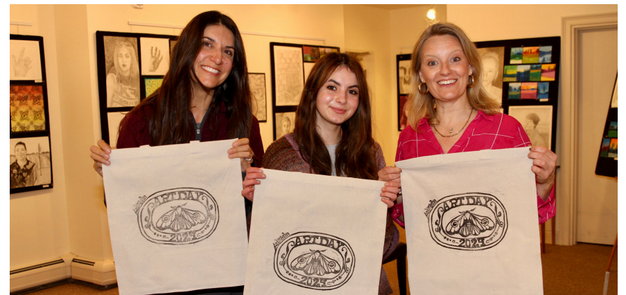
Art Day drew a big crowd, showcasing student artwork and interactive art stations.