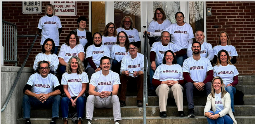
The AMHS team is dedicated to creating a positive, enriching learning environment for all students.