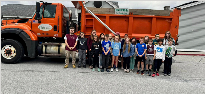
Fisher's 5th grade names the Vermont AOT plow truck "Clearapartha."