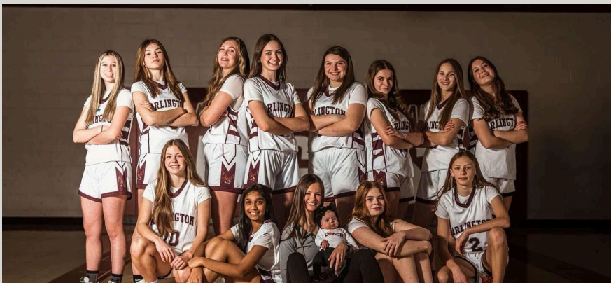
AMHS Athletics shine across every season!