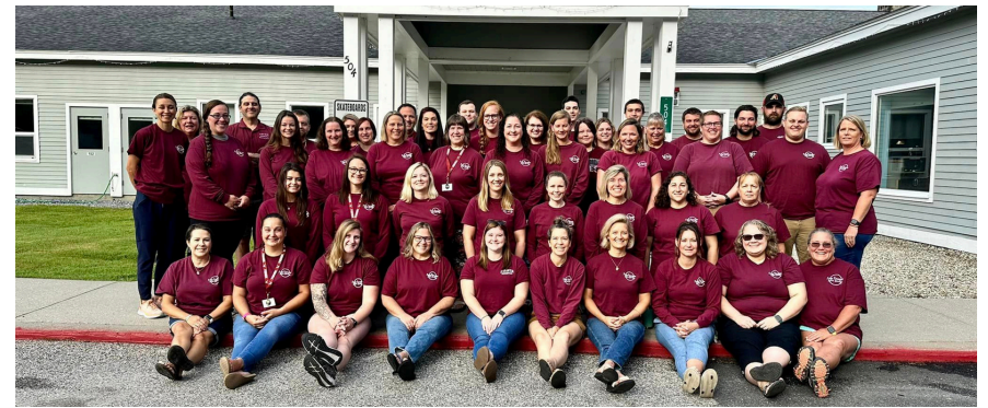
Fisher's dedicated teachers and staff inspire and support every student's journey.