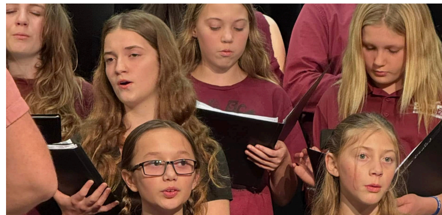
The AMHS Chorus performs for families during a winter concert.